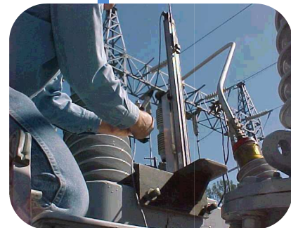
TRANSDUCER (ZLT, ZOT, ZRT) + BASE (ZLB, ZLR, ZMS)