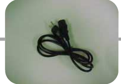
CAB-ALIM 100-240 VAC 0-60Hz