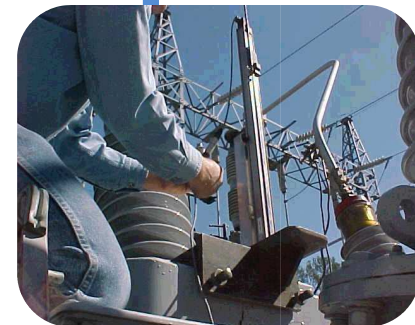
TRANSDUCER (ZLT, ZOT, ZRT) + BASE (ZLB, ZLR, ZMS)