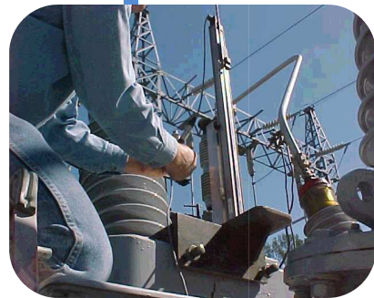
TRANSDUCER (ZLT, ZOT, ZRT) + BASE (ZLB, ZLR, ZMS)