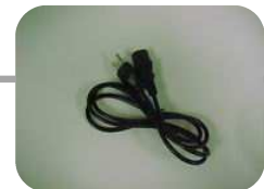
CAB-ALIM 100-240 VAC 0-60Hz